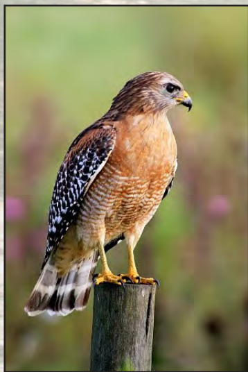
FOOD MAY BE CACHED FOR LATER

WITH THEIR REPETITIOUS CALLS, RED-SHOULDERED HAWKS ARE KNOWN TO BE THE NOISIEST WHEN COMPARED TO OTHER SPECIES IN THE SAME FAMILY. THESE BIRDS CAN USUALLY BE SEEN ON SNAGS AT THIS PROPERTY LOOKING FOR FOOD.