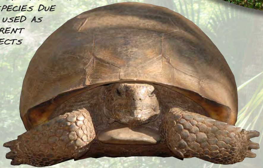
GOPHER TORTOISES CAN LIVE MORE THAN 40 YEARS

THE GOPHER TORTOISE IS A TERRESTRIAL TURTLE AND A VERY IMPORTANT SPECIES FOR THE FLORIDA ECOSYSTEM; THEY ARE FOUND IN ALL 67 COUNTIES. THESE TORTOISES ARE KNOWN AS AN UMBRELLA OR KEYSTONE SPECIES DUE TO THEIR BURROWS THAT ARE USED AS HOMES FOR OVER 360 DIFFERENT SPECIES, RANGING FROM INSECTS TO MAMMALS.