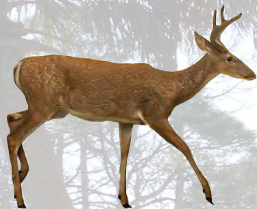
DEER WILL EAT THE LEAVES

RUSTY LYONIA IS A TYPE OF SHRUB OR SMALL TREE THAT CAN GROW TO 10-20 FEET TALL. IT GETS ITS NAME FROM THE "RUSTY" PUBESCENCE OR SOFT HAIR THAT IS PRESENT ALL OVER THE PLANT, PRIMARILY ON THE LEAVES AND WHICH RUBS OFF JUST LIKE RUST.