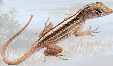
DIET TYPICALLY INCLUDES LIZARDS

THE SOUTHERN BLACK RACER IS FLORIDA'S MOST COMMON NON-VENOMOUS SNAKE. THE BLACK RACER HAS A SLENDER BLACK BODY WITH A WHITE UNDERSIDE. BLACK RACERS CAN LIVE UP TO 10 YEARS AND GET TO BE OVER 60 INCHES LONG WHEN FULLY GROWN. THE LONGEST BLACK RACER MEASURED 72 INCHES OR 6 FEET LONG!